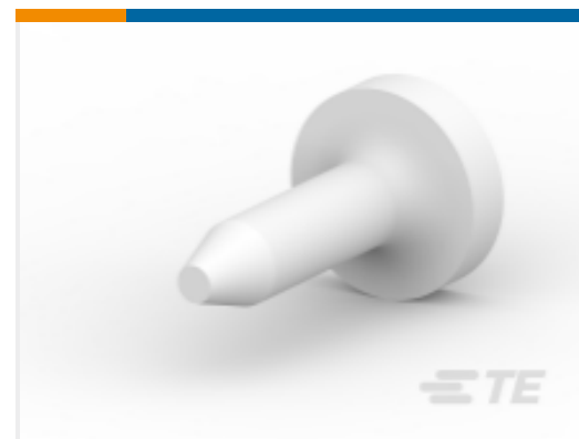
TE Part # 206509-1 SIZE 20 KEYING PLUG